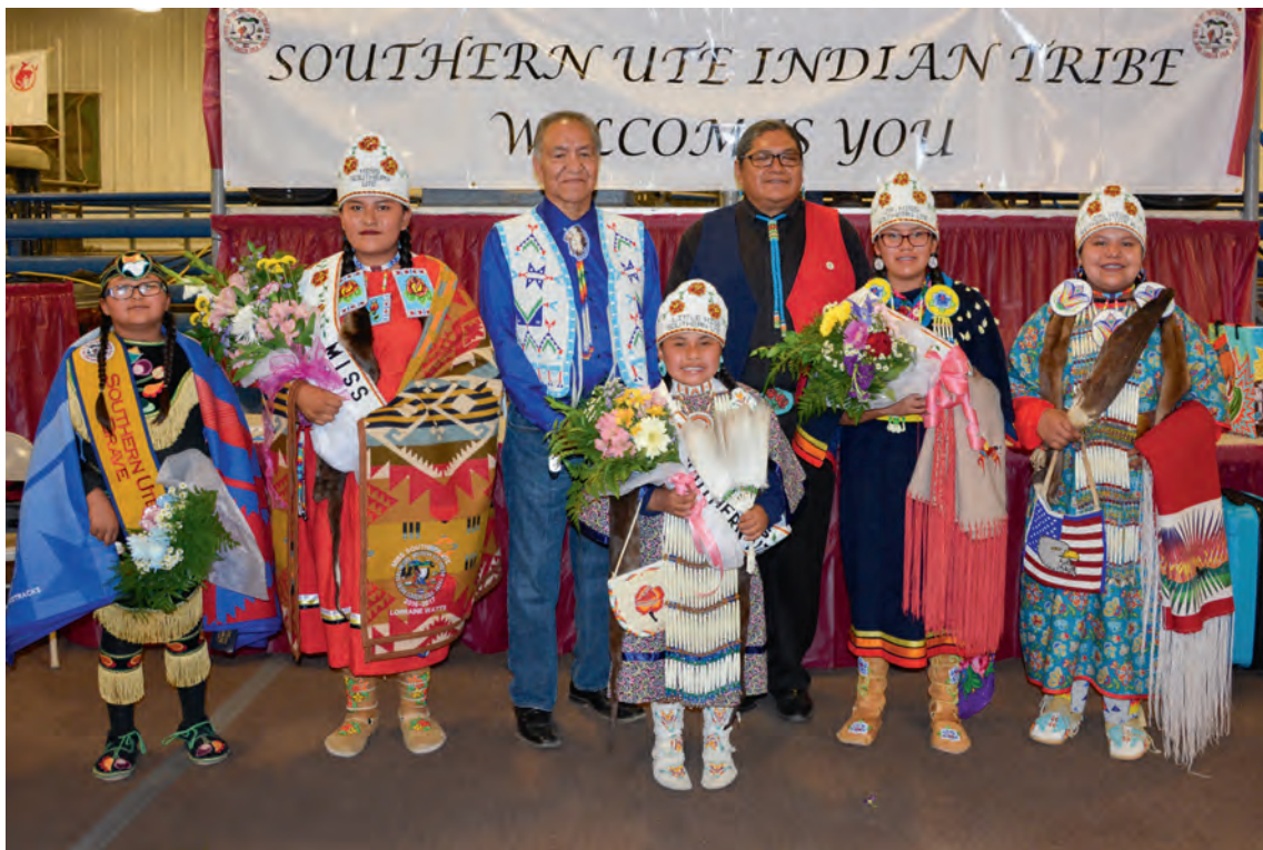
2017-2018 Southern Ute Royalty (Left -Right)