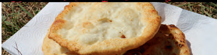
SU Culture Archives