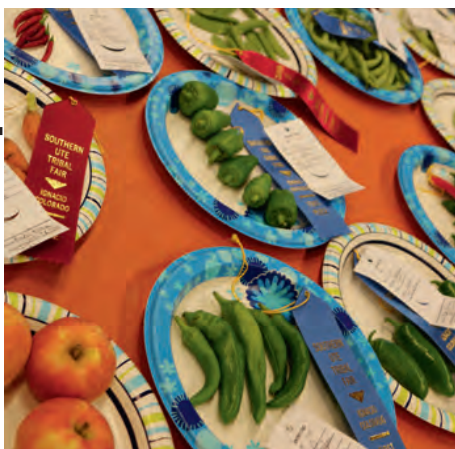
SU Culture Archives