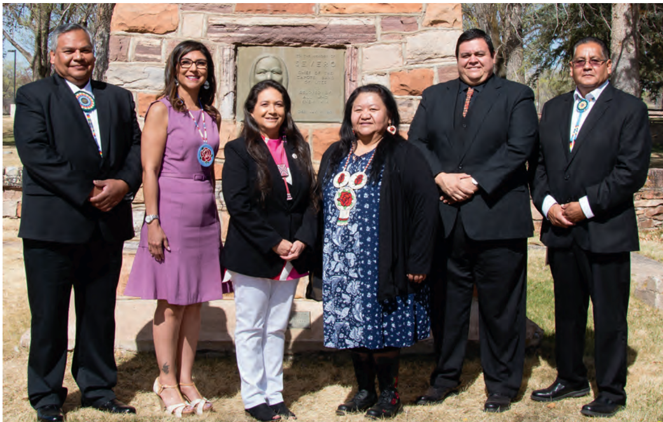
2017-2018 Southern Ute Council (left-right)