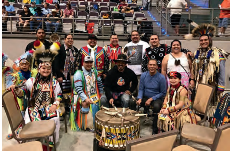
THA BOYZ Comanche