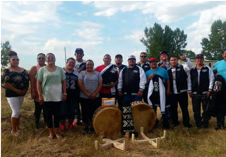
WILD BAND OF COMANCHES Comanche