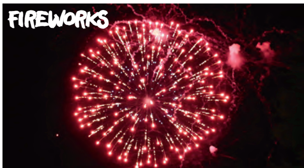
Kree Lopez/ SU Culture