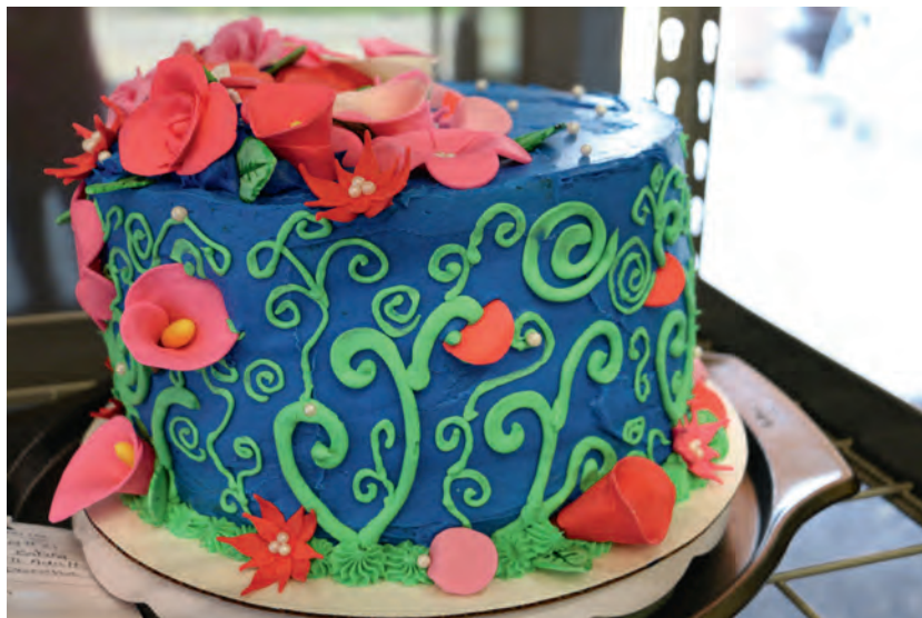
SU Culture Archives