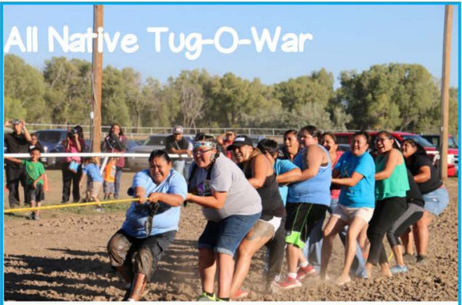
Kree Lopez/Southern Ute Culture Department