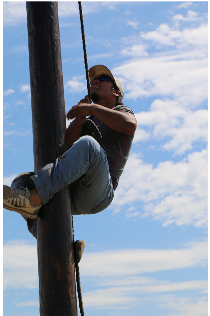
Kree Lopez/Southern Ute Culture Department