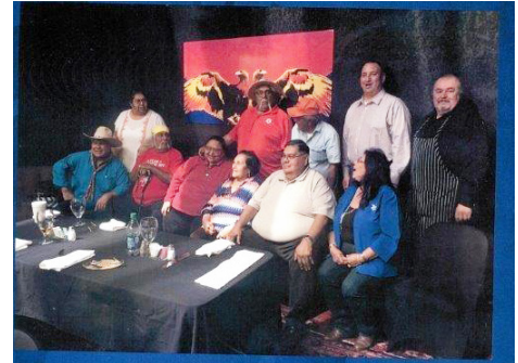
Sovo Family (Comanche)