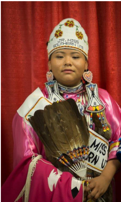
Jeremy Shockly/Southern Ute Drum