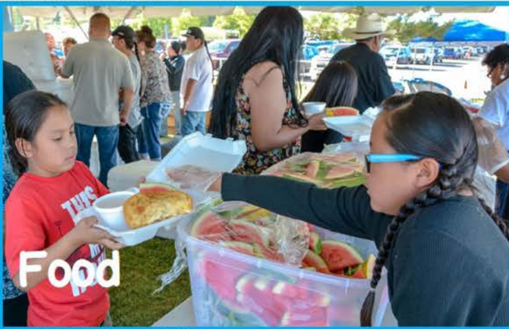
Sach Smith/Southern Ute Drum